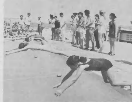
Swimming at Pova